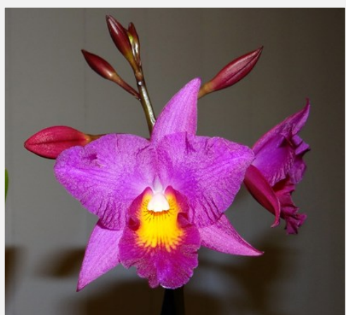
Dodara Cape Sunshine