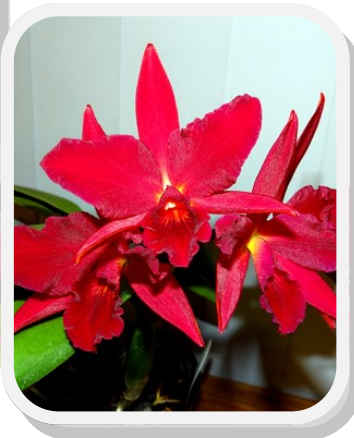
Catt. Jewel Box 'Dark Waters'