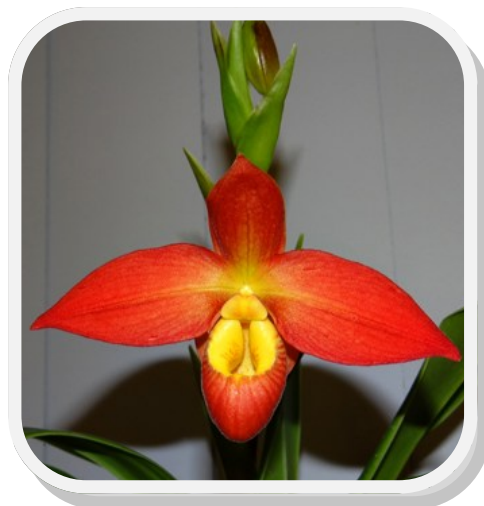
Phragmipedium Rachel Kirk