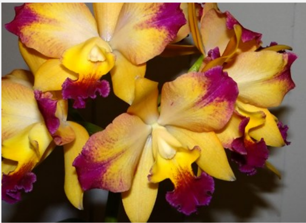
Catt. Straight Answer 'No Question'