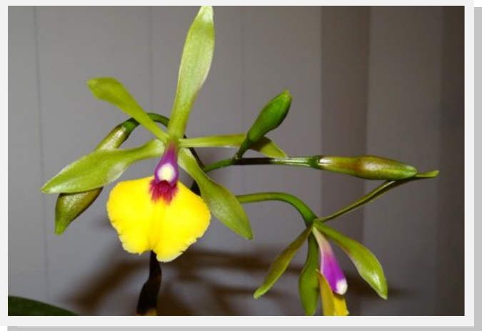
Epicat. René Marqués 'Flame Thrower'